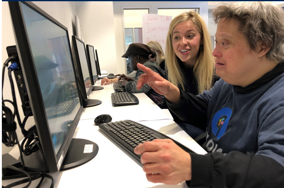
In the Harry and Jeanette Weinberg Career Academy, one of Aspire’s career-minded participants sparks joy when she shares a recent success with this visiting corporate volunteer.

In January of 2019, both organizations’ boards formed a Joint Negotiating Committee. Discussions progressed quickly, aided by critical pro bono expertise from Aspire partner Athletico, which has extensive experience in mergers and acquisitions and integrating new partners.