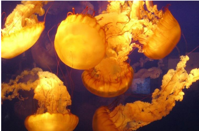
Photo: Jellyfish display, Ocean Journey building, the Tennessee Aquarium.

three institutions. Although each retained its individual identity and continued to be governed by its respective board, the institutions now share four directors: HR, Finance/Accounting (CFO), IT and Marketing, and Retail Sales. This structure is at the core of the consolidation, and as the lead partner, the Aquarium employs the four shared directors who report to the Aquarium's CEO as well as the Directors of the CDM and the Hunter.