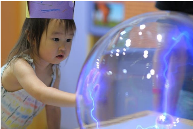
Photo: Inventors' Clubhouse, Creative Discovery Museum.

Apart, the museums had never been able to generate this level of funding, and they used the revenues for both internal investments, such as constructing new buildings for the Hunter and the Aquarium and renovating and creating exhibits at the CDM, as well as external improvements in the community, including building new parks, improving infrastructure along the Chattanooga waterfront, and launching a public arts program. These investments further solidified the museum partnership and sent a signal to the larger community that they were serious about the continued rejuvenation of Chattanooga and improving the quality of life for its residents. According to Tennessee Senator, Bob Corker, “The synergies involved in this partnership are just astounding. These institutions see cost savings, gain expertise, and increase their credibility in the community among visitors.”