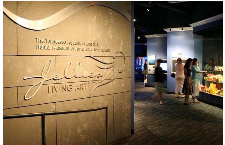
Photo: Gallery entrance to Jellies: Living Art, presented by the Tennessee Aquarium and the Hunter Museum of American Art.

The Hunter, Chattanooga's oldest cultural institution, faced an entirely different, although equally challenging situation. Perched on a bluff overlooking downtown and the Tennessee River, the Hunter had become internally focused and was no longer realizing its potential to reach and connect with the community. This detachment, which had left it unable to effectively serve its constituents, was further complicated by the museum's outdated operational infrastructure that took valuable staff time away from upgrading exhibits and designing innovative programs and would require a significant financial investment to modernize.